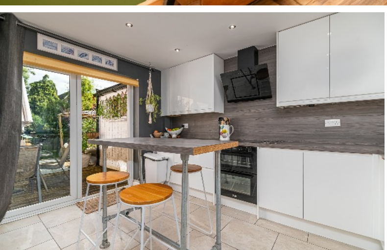
24 Victoria Avenue Market Harborough LE16 7BQ